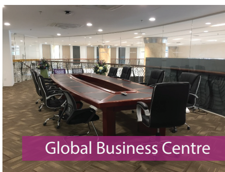
Global Business Centre